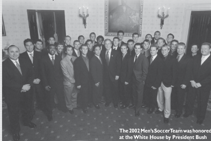
The 2002 Men's Soccer Team was honored at the White House by President Bush