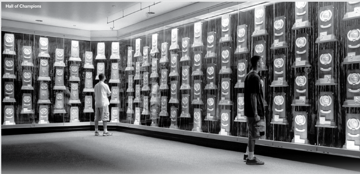
Hall of Champions

No institution of higher learning can match UCLA's history and continuity of collegiate athletics and academics success.