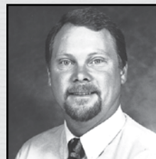
Paul Brown Event Management